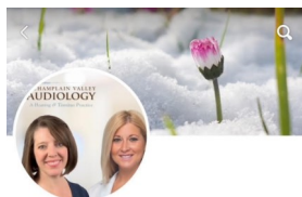
Champlain Valley Audiology

This month's edition of your RENY Newsletter welcomes Champlain Valley Audiologists to our advertiser's page.